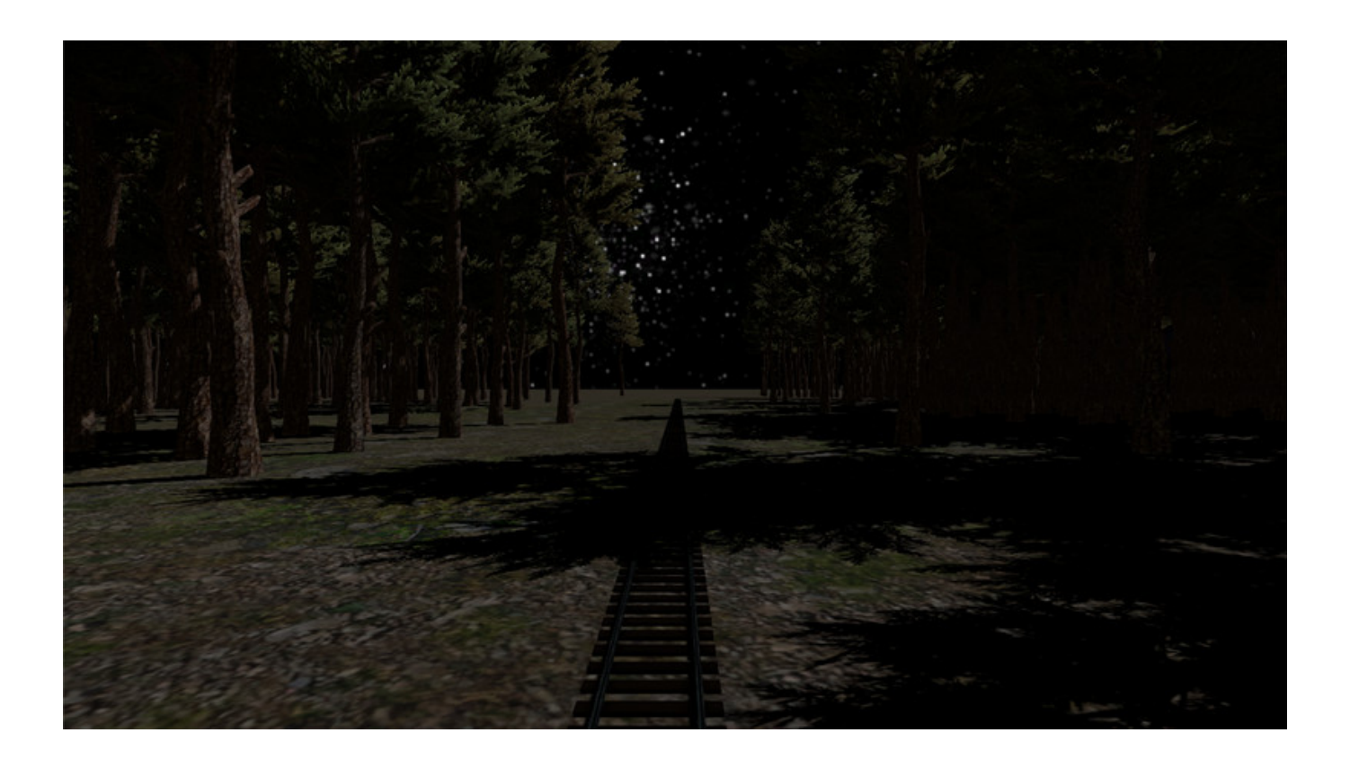
Download ->->-> http://bit.lv/2JW3Wju

Mordheim: City Of The Damned - Wolf-Priest Of Ulric Activation Code [Crack Serial Key